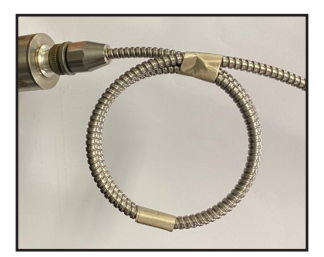
Figure 3: To maximize RFI immunity with an armored cable, put two 10 cm diameter turns in the armored cable within 10 cm of the ST5484E transmitter.

If you are using an armored cable, usually associated with our 2-Pin MIL Style Connector, then it's useful to put two 10 cm diameter turns in the armored cable within 10 centimeters of the sensor to minimize RFI. See Fig. 3 below.